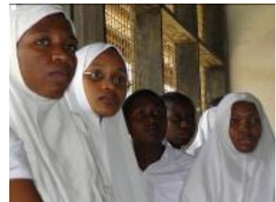
Searching hearts opened