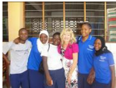
Eager hearts received His truth