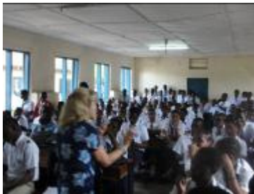
Using God's story to speak forth the Gospel