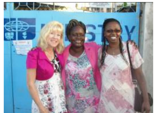
Tanzania Life Ministry leaders will multiply it!