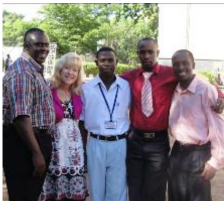
Kenya Student Venture leaders led the mission! PTL!